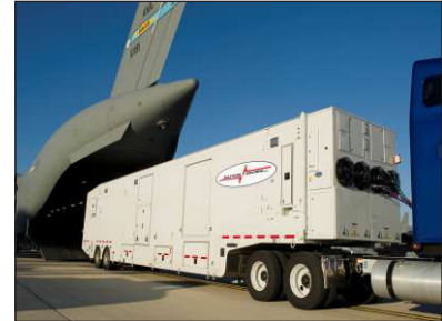
Self-sufficient, Forward Operating Base SCIFs for advanced and remote deployments