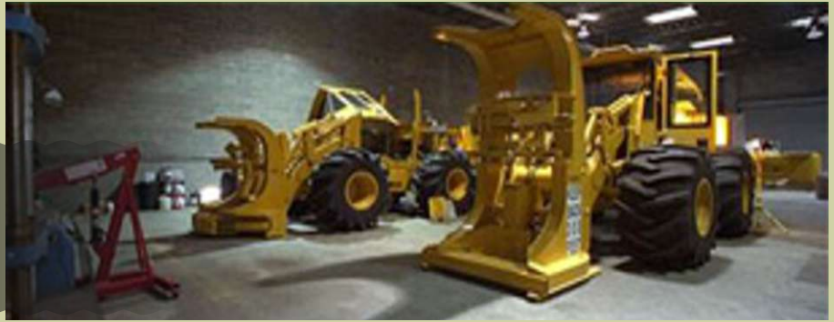
Teardown facility at DTB