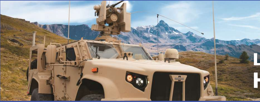
Testing for all environments