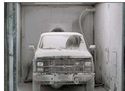
Environmental Sand & Dust Testing