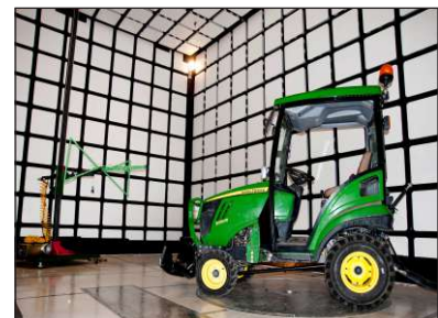
EMI/EMC Semi-Anechoic Testing Chamber