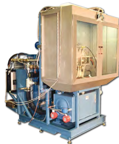
Oil Pump Test Stand