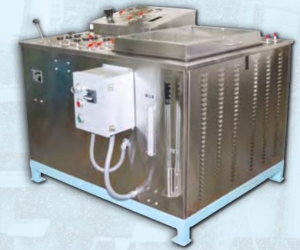
UH-60 Strut Test Stand

Equipment Updates – updates are available for our existing products to keep up with advances in technology or growth in customer requirements. Typically, these upgrades are performed at the customer's site, reducing customer cost and facility downtime.