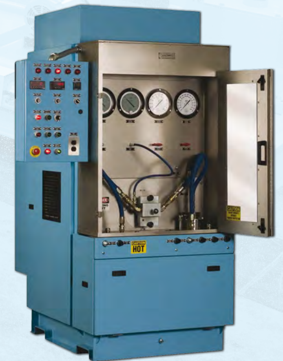
Aircraft Hydraulic Pump Test Stand

Equipment Updates – updates are available for our existing products to keep up with advances in technology or growth in customer requirements. Typically, these upgrades are performed at the customer's site, reducing customer cost and facility downtime.