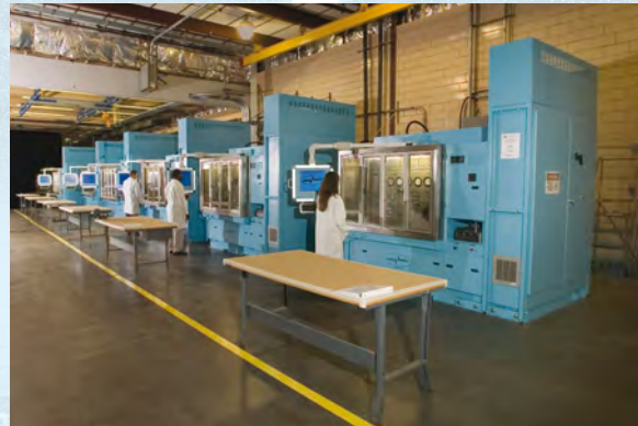
Universal Automated Hydraulic Test Stands

Dayton T. Brown, Inc. has 35 years of experience in test equipment design and manufacturing. DTB test equipment is offered in manual, semi-automatic, and fully automatic configurations.