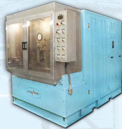
Radiator Flushing Stand

DTB's test equipment is used by original equipment manufacturers, military overhaul depots, commercial airlines and maintenance, repair, and overhaul activities to satisfy rigorous production quality assurance requirements.