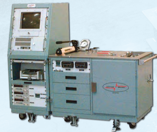
Model MCS-6150 Calibration Cart