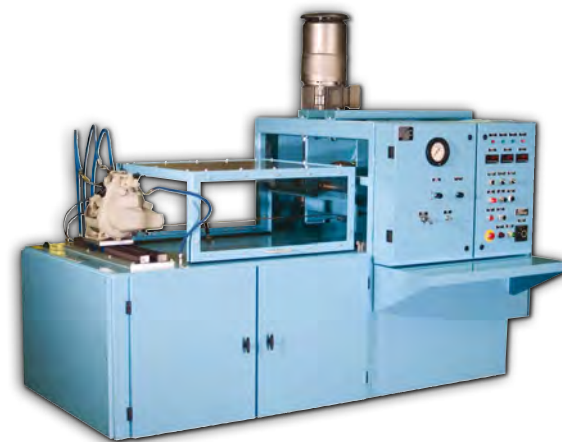
Hoist and Winch Test Stand