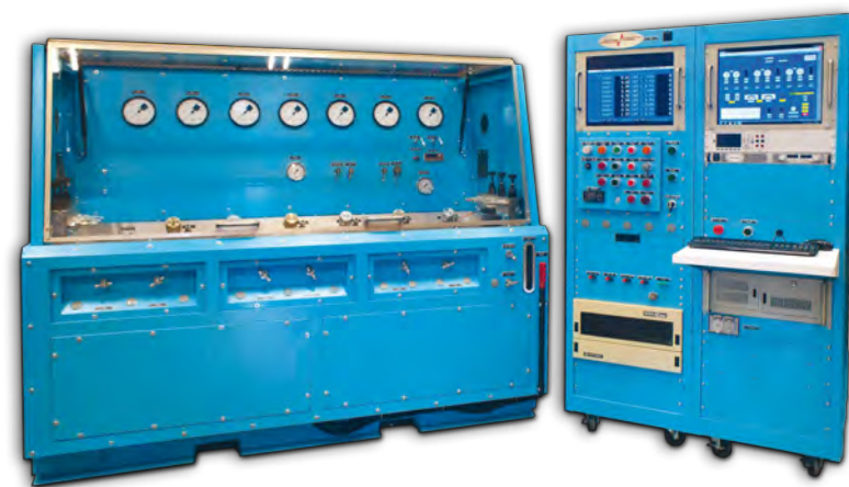
Model LE6000R General Purpose Hydraulic Test Stand