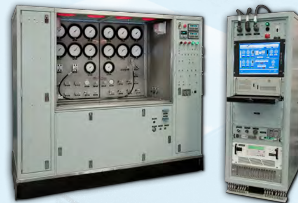
Model A/F 27T-10 Hydraulic Component Test Stand