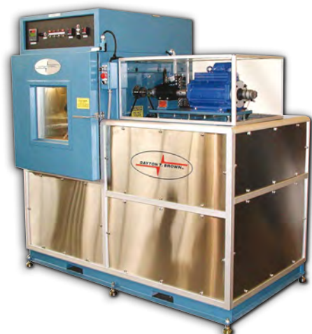
Vacuum Pump Test Stand