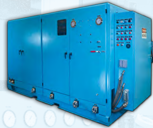
Model CP/S-6250 Remote Hydraulic Power Supply

DTB offers a complete range of product support services