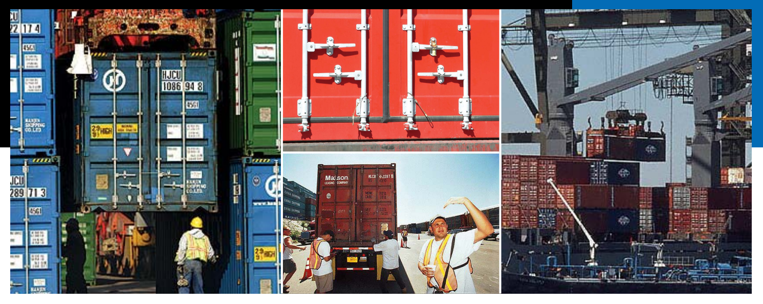
Dayton T. Brown, Inc. provides a wide range of Security Seal Testing: Padlock Seals, Strap Seals, Cable Seals, Cinch/Pull-up Seals, Twist Seals, Scored Seals, Label Seals, Barrier Seals and RFID Seals. Testing is performed in accordance with ISO 17712:2013.