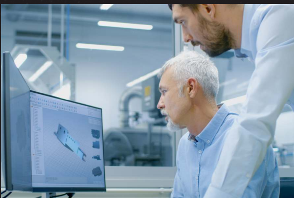
Our team of specialists will work with you to analyze and determine your program requirements