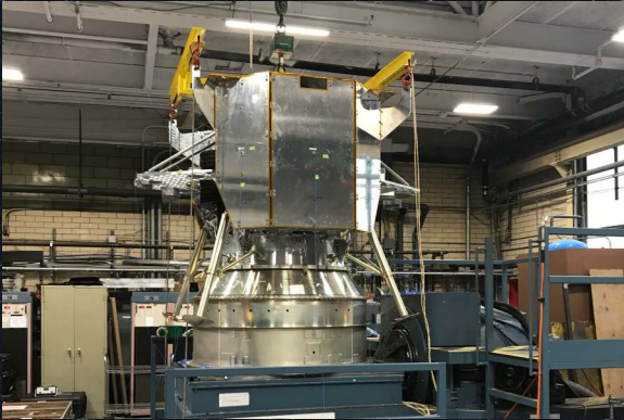
Vibration Testing lunar lander