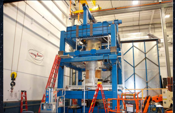
Rocket/Missile structural testing