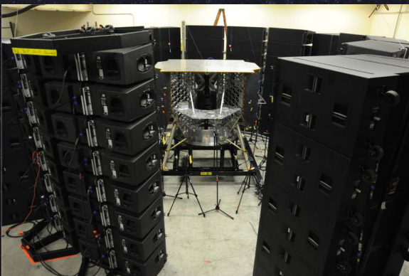
Direct Field Acoustic Testing on lunar lander